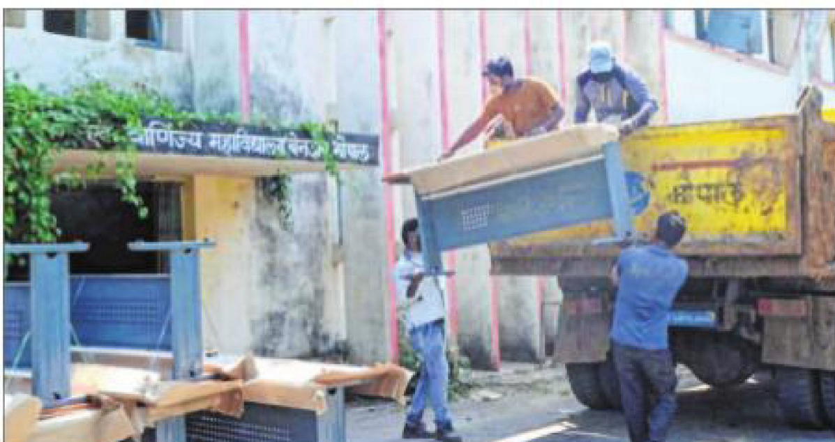
Benazir college located adjacent to MVM college was shifted to Kolar on Saturday