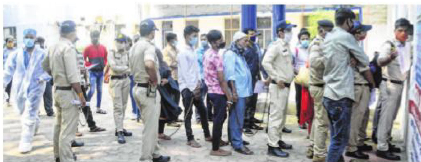
People in queue for corona test at JP Hospital on Saturday

According to official release, AIIMS and Gandhi Medical College (GMC) reported one positive each. RKDF reported one positive case. Four members in the same family tested positive and while six members of a family tested positive in Arera Colony. Sanskrit Pathshala (Gandhi Nagar) reported four positive cases.